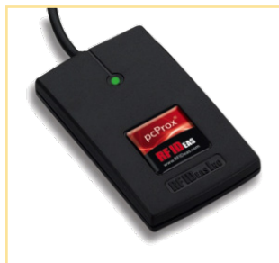
MX-SW100 works with Sharp OSA Partner Program Member card reader solution for convenient print release with ID card.